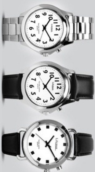
Watch style, strap and bracelet options may vary