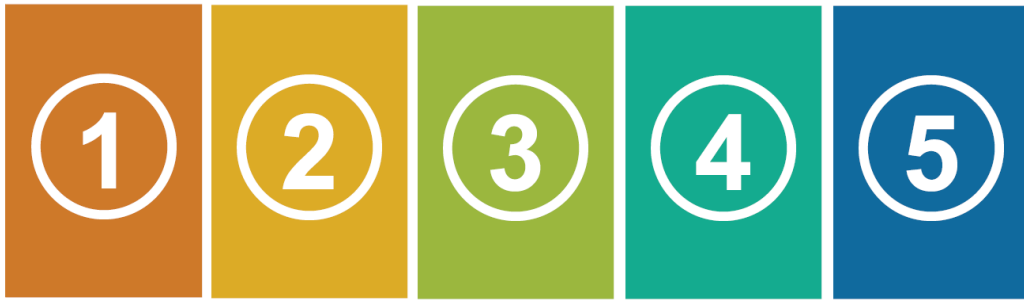
Table 1. Performance Levels