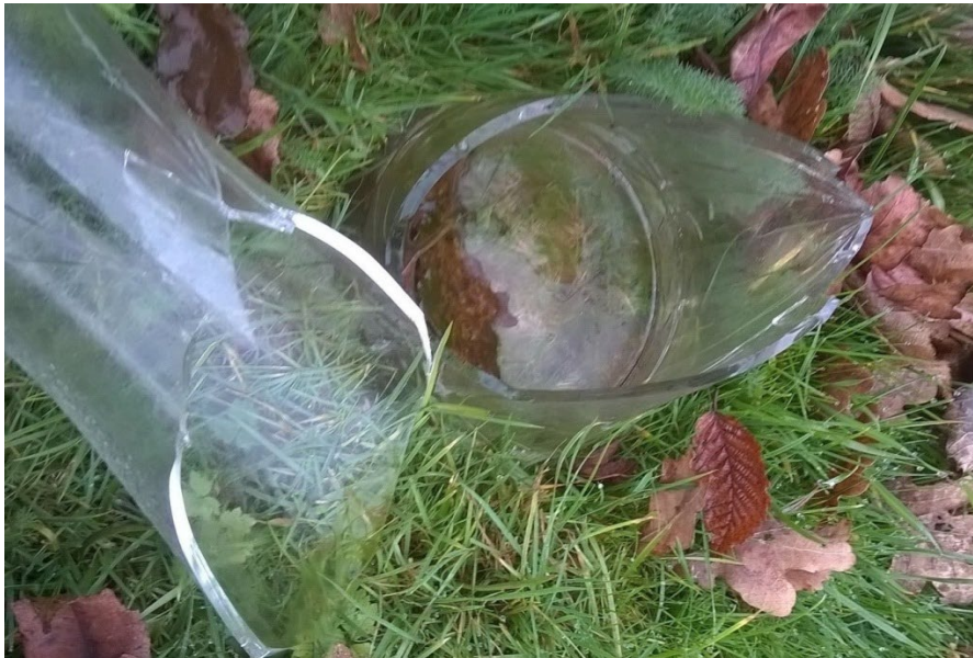
An example of unauthorised, hazardous memorabilia

Glass vases, astro turf, wind chimes, naked flames, balloons, solar lights, lanterns, and wire fencing.