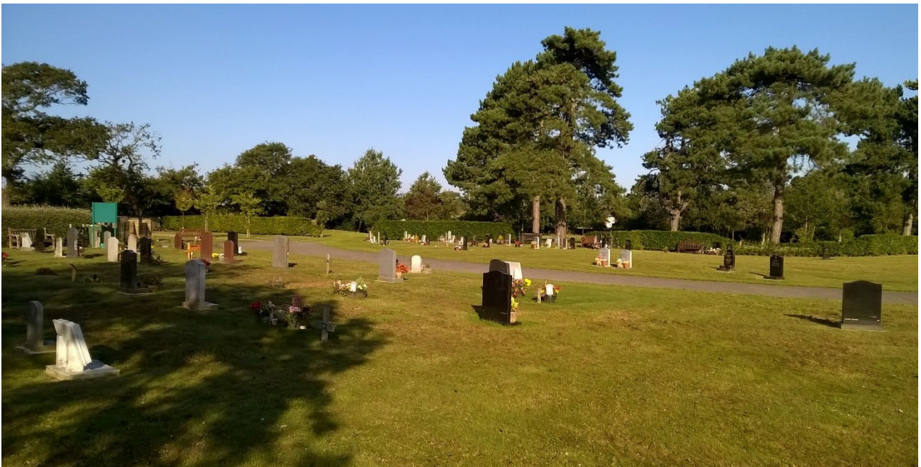
Milford Road Cemetery. An example of an NFDC Cemeteries Lawn Section.

Flower vases must be an integral part of the memorial or, if removable, must be placed no more than 15 inches (380mm) in front of the authorised memorial headstone base (See 11.1.1).