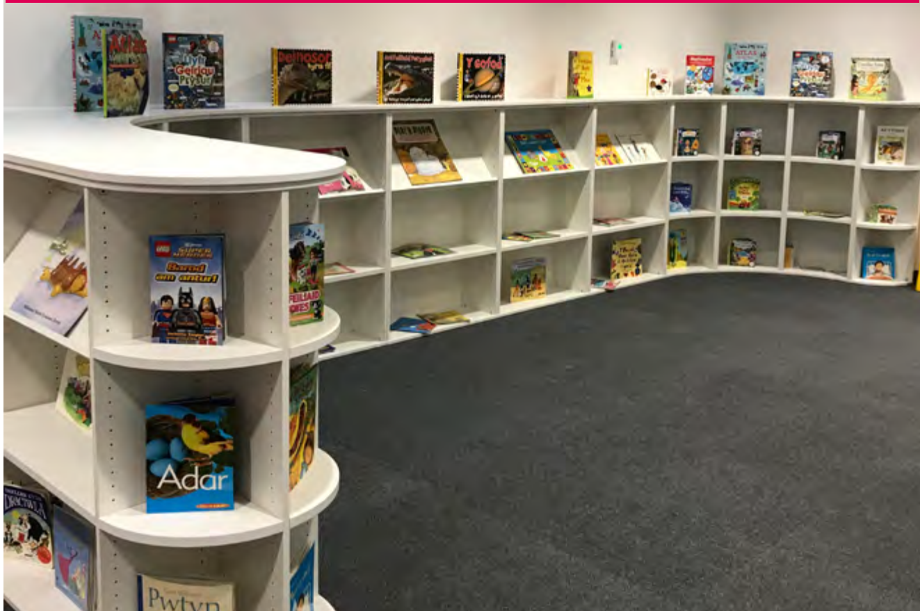
Recent new build primary school in Cardiff - Ysgol Hamadryad