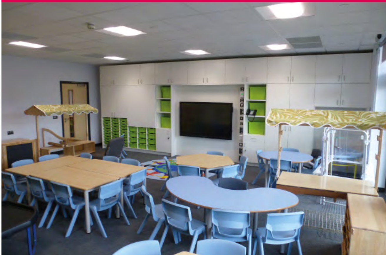
Classroom - Glan Morfa

The new Curriculum in Wales sets new expectations for schools and learners. There will be a single curriculum for Wales that will apply in Welsh-medium, English-medium and bilingual schools. The expectations in Wales for those learning Welsh in English-medium schools will gradually be increased as the first cohorts learn through the new curriculum in order to realise the national ambition of 1 million Welsh speakers by 2050.