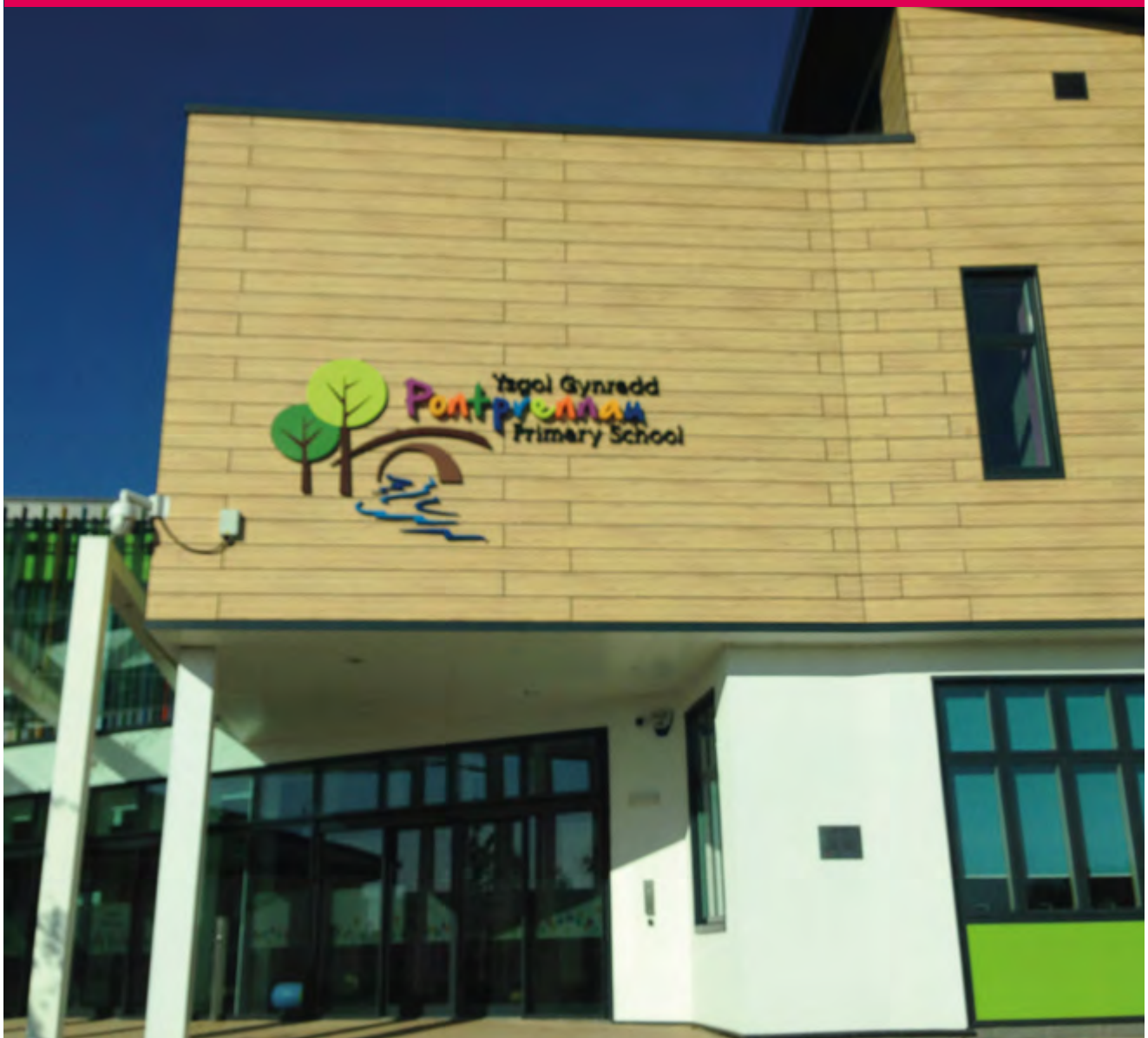
Recent new build primary school in Cardiff - Pontprennau Primary School

To date, approximately 90 houses have been completed and are occupied on the early phase of the development on the northern side of Llantrisant Road.