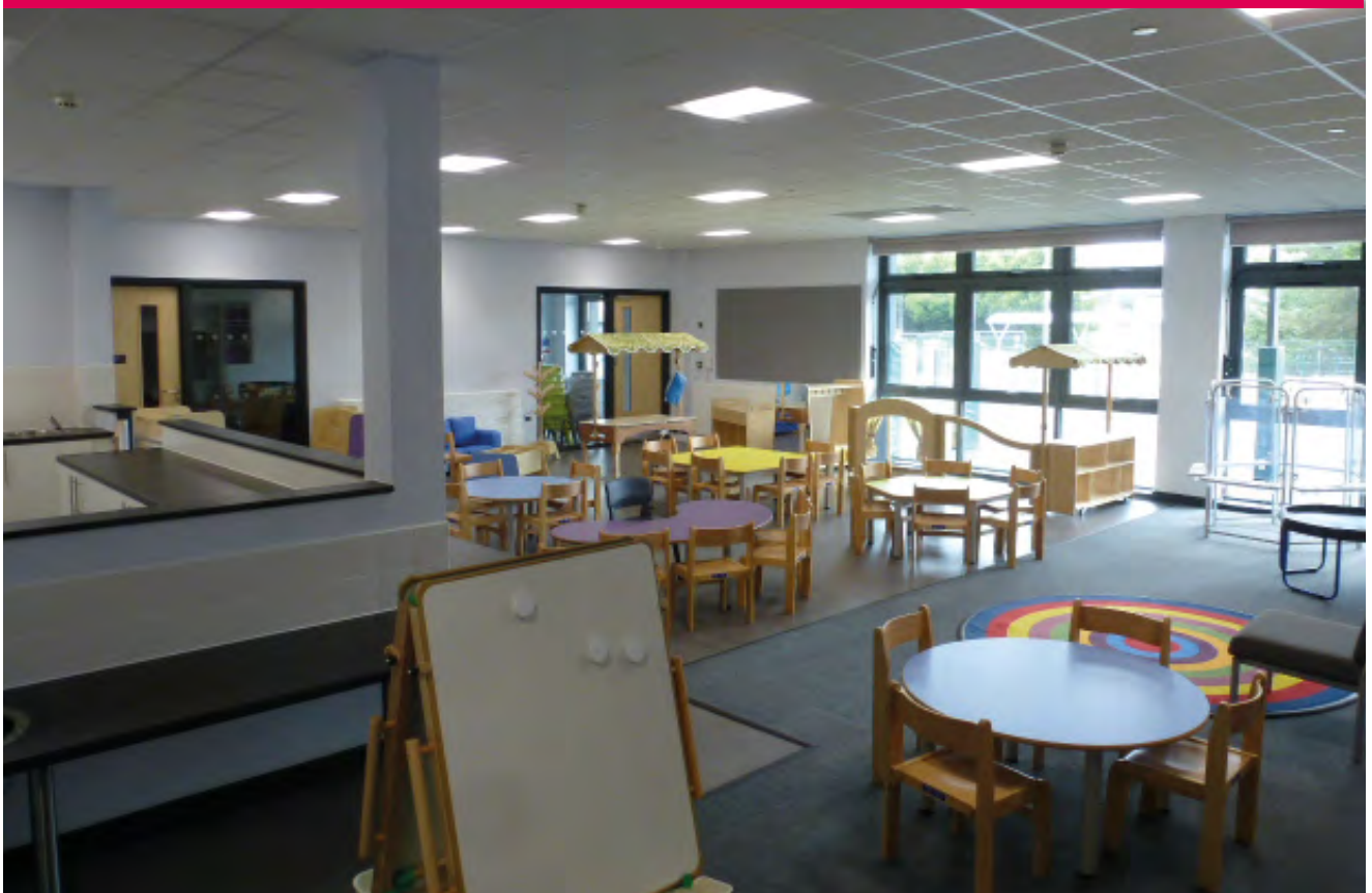
Recent new build primary school in Cardiff - Ysgol Glan Morfa

An offer of a nursery place at the school does not mean that a child will also be offered a place in Reception. A separate application form must be completed for admission to Reception.