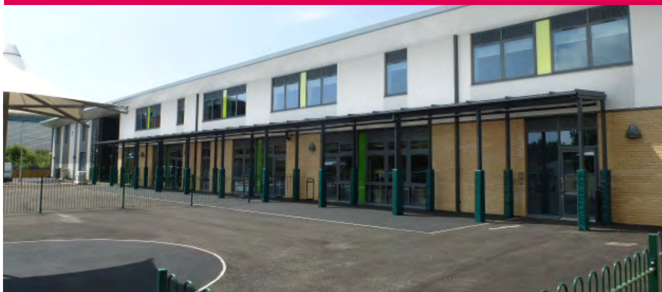
Recent new build primary school in Cardiff - Ysgol Glan Morfa

The new primary school is to be procured by the developer and construction is proposed to complete in Summer 2021.