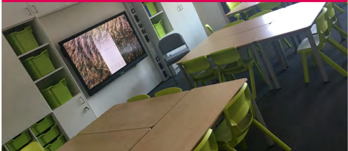
Recent new build primary school in Cardiff - Howardian Primary

Taking into account only the English-medium schools in closest proximity to the proposed new school to serve parts of the Plasdŵr development (namely Danescourt Primary School, Peter Lea Primary School and Radyr Primary School), there are very few surplus places (69) – approximately 6% of capacity.